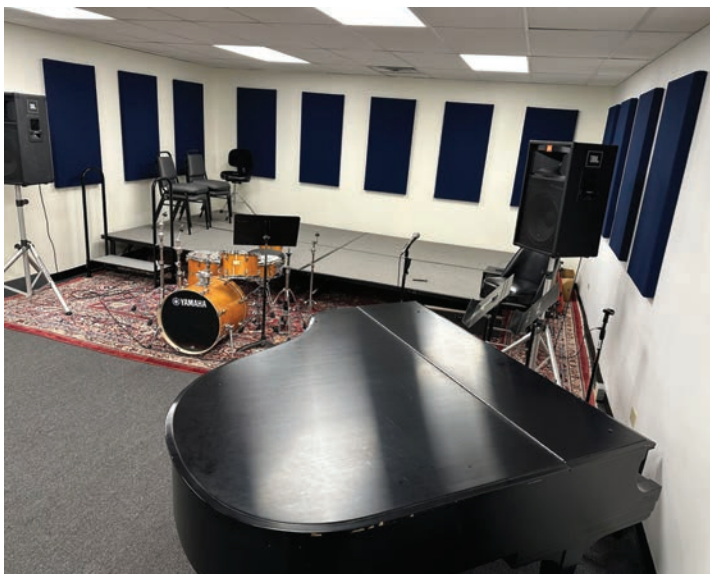
CFM's rehearsal space can be reserved for $10/hour