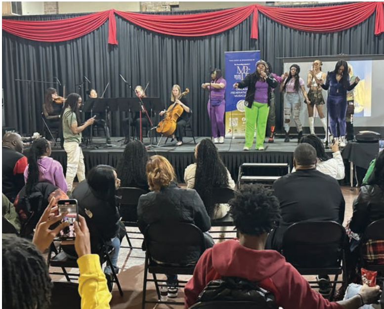
Above: Women's hip-hop collective, Pink Cypher takes turns at the mic to pay tribute to some of hip-hop's most well known women artists, accompanied by KAIA String Quartet .