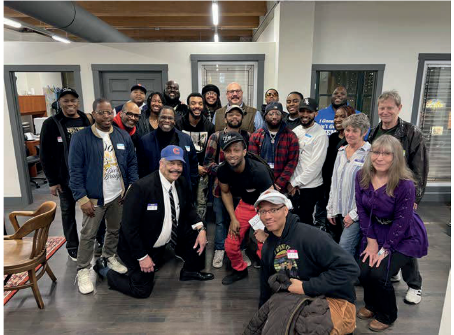
A large group of members pose for a photo at the CFM Open House

On Monday, February 26th, CFM hosted an Open House in our new office space. It was a wonderful opportunity for members new and old to come together and spend the evening socializing.