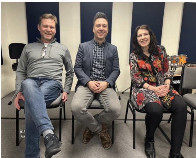
Our Composer Panelsits lead discussion with attendees

Above: Friends from The Kehrein Center paid a visit to the CFM Board Meeting on March 12th. Below and left: CFM hosted Third Coast Music for a Composer Meet and Greet on March 27th